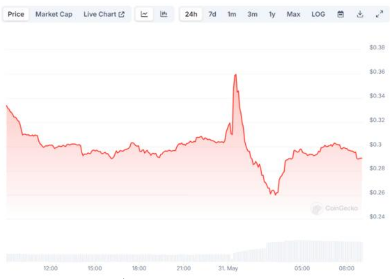
BODEN Price, Source: CoinGecko

Curiously, Joe Biden, Trump's primary rival for the presidency of the United States, was also associated with one meme coin that saw extreme volatility. Every single day, the value of Jeo Boden (BODEN) drops by 15%.