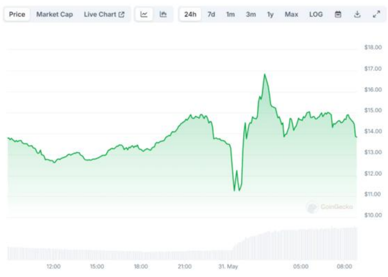
TRUMP Price

Some meme coins associated with the former president and current Republican presidential candidate saw increased volatility after the court's ruling. In the minutes following the judge's decision, MAGA (TRUMP) fell from $13.50 to $11.20. After that, it surged 50% to a new all-time high of $16.80 before falling back down. According to CoinGecko's data, it is currently hovering around $13.90.